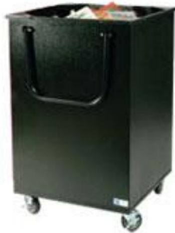
330 Item Bin