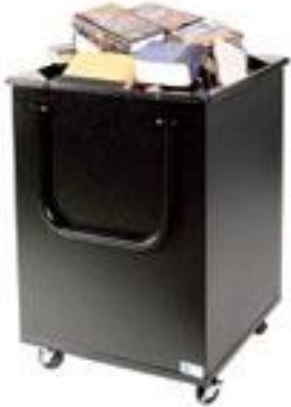
150 Item Bin