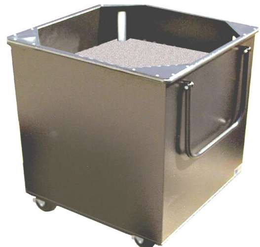
500 Item Bin